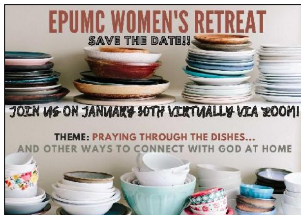
EPUMC Women’s Retreat details on page 5.

Pastor Becky Jo are planned. Turn to Page 8.